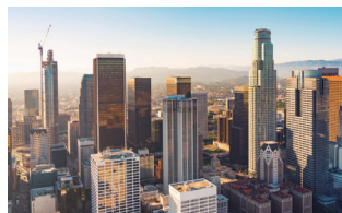
Urban High-Altitude Observation