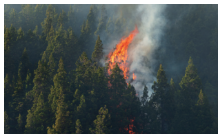
Forest Fire Monitoring