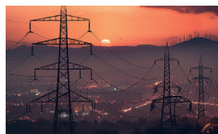
Electric Routine Inspection