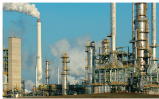
Oil and Gas Pipelines