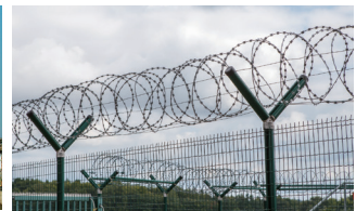
Critical Infrastructure Protection